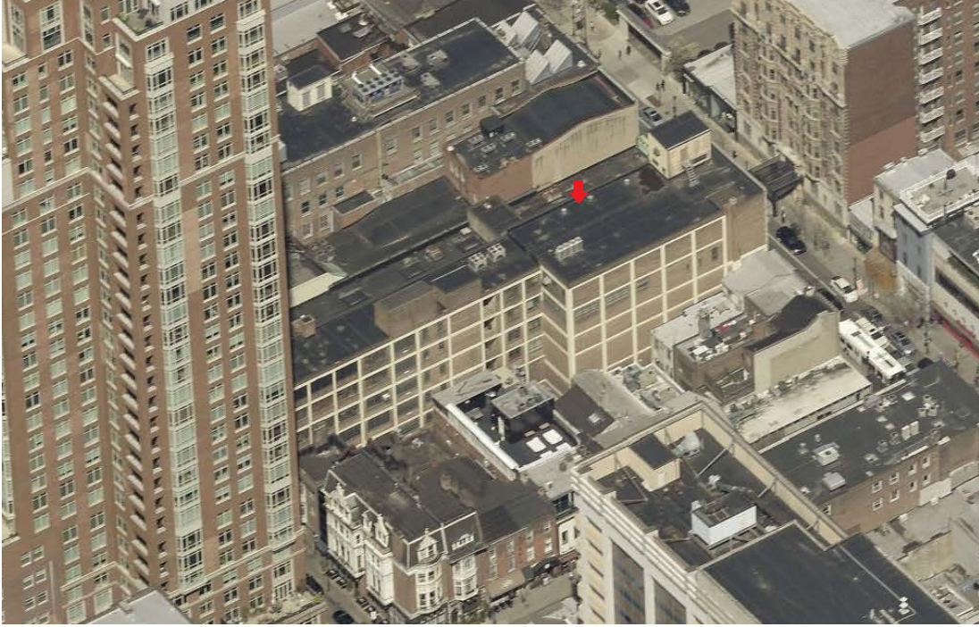
Figure 4. The east elevation of Samuel T. Freeman & Co.'s auction house, 2018.