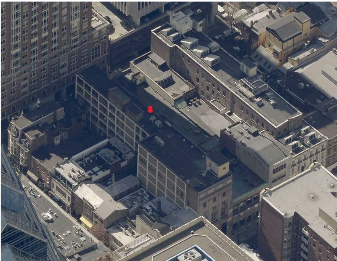
Figure 5. The north and east elevations of the building, 2018.