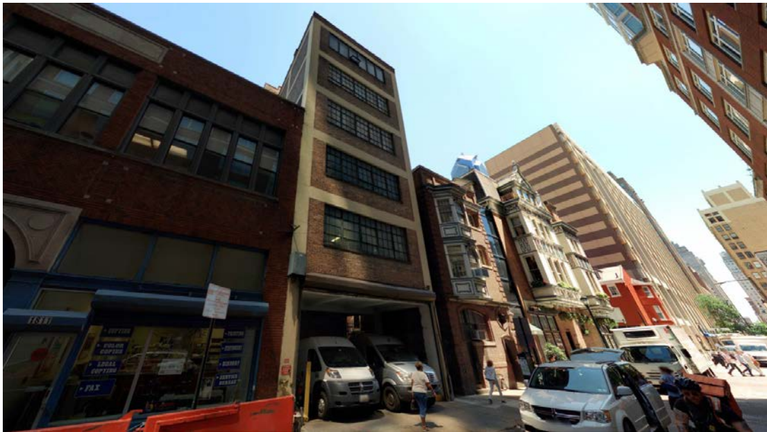
Figure 3. The south, or Sansom Street, elevation of the auction house, 2018.

To balance the elongated base, the building’s verticality is emphasized at the third through fifth stories through the incorporation of four Ionic pilasters that span all three stories. At the third story, three openings each contain a pair of French doors that open onto Juliet balconies with decorative iron railings. Pairs of casement windows add height above the doors, and each opening is capped by pediments to create further emphasis and differentiate the third story from those above. The fourth and fifth stories remain relatively unadorned, containing simple double-hung windows below an entablature that separates the sixth story from the rest of the façade. The sixth story maintains the rhythm of the openings with three equally spaced windows below a simple cornice.