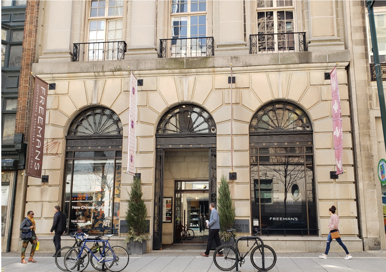
Figure 12. The entrance and ground-story windows of the Samuel T. Freeman & Co. building, 2019.

realized, it closely resembles the Brinton fixture Yellin designed to span the main entrance. That fixture, in addition to the detailing at the balconies, transoms, and entry gate, suggest that the Freeman commission offered yet another opportunity for the architecture firm and iron worker to collaborate, as was common in Tilden & Register's suburban residences.