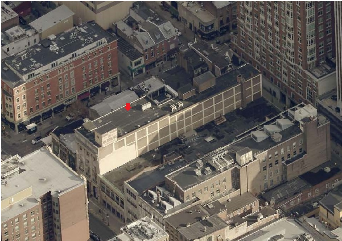
Figure 6. The west elevation of the Samuel T. Freeman & Co.'s auction house, 2018