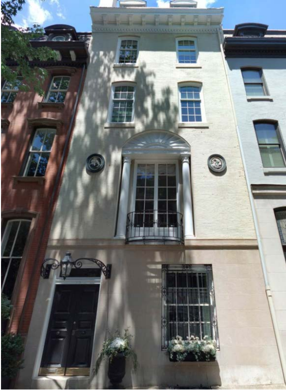
Figure 10. 2031 Delancey Place, altered by Tilden & Register, 2018.