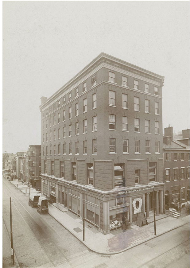
Figure 8. Samuel T. Freeman & Co.'s location at 1229 Walnut Street, c. 1898-1908.