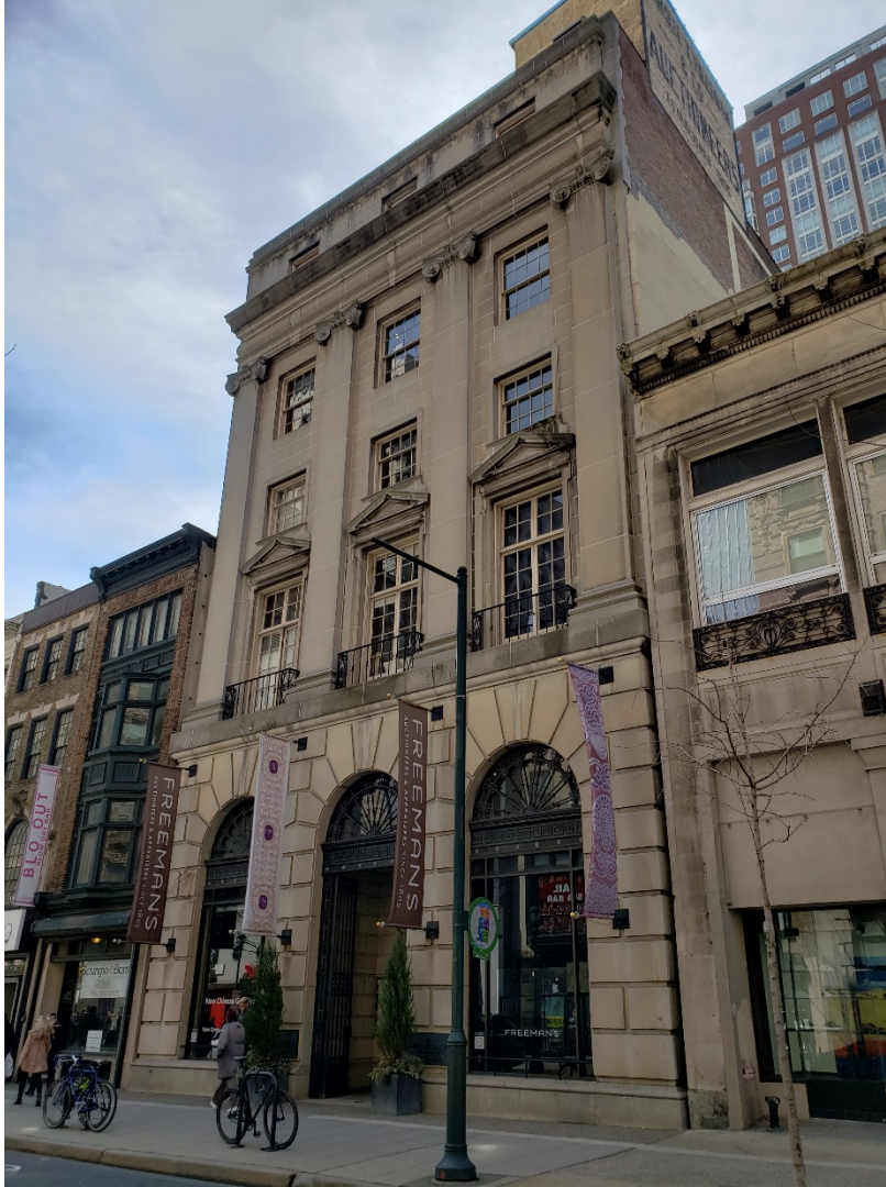
Figure 2. Chestnut Street façade, 2018.

Located on the south side of Chestnut Street two blocks north of Rittenhouse Square, the six-story Renaissance Revival structure has afforded the Samuel T. Freeman & Co. a powerful presence on one of Philadelphia's main commercial strips since its 1923-24 construction. With its front façade consisting of concrete cast in classical forms, the secondary facades consist largely of brick. The flat-roofed building occupies the width of two parcels along Chestnut Street and narrows at the rear where it fronts onto Sansom Street.